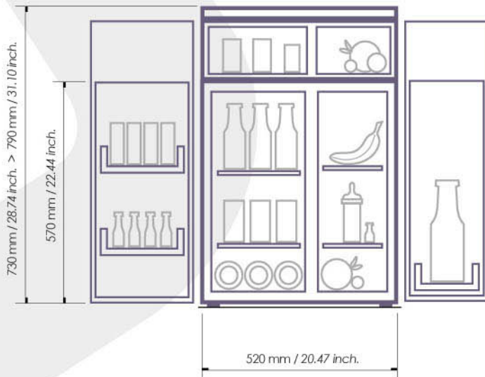
Integrated dry sections available on wooden door versions