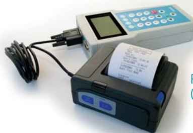
Portable Printer (optional)