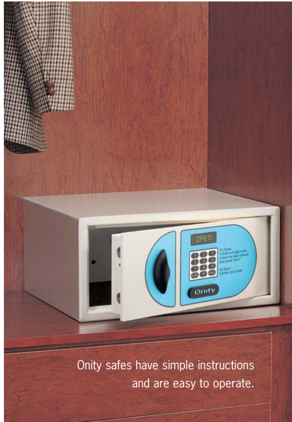
Onity safes have simple instructions and are easy to operate.

Mini Height: 8.03 in 204 mm Width: 16.69 in 424 mm Depth: 8.66 in 220 mm Volume: 4.9 gal 18.15 lts Weight: 26.37 lbs 12 kgs